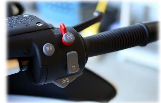
2 Position Light Control Switch (Pursuit/Traffic Stop mode)