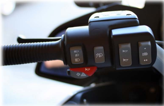
Relocated Heated Grip Switch Siren Switch (Wail/Yelp)