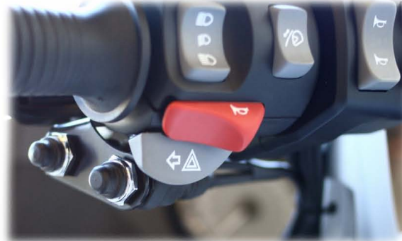
Momentary Push button Siren Switch (Manual/Airhorn)