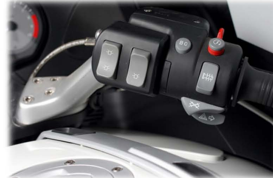
On/Off Power Switch 2 Position Light Control Switch (Pursuite/Traffic Stop)