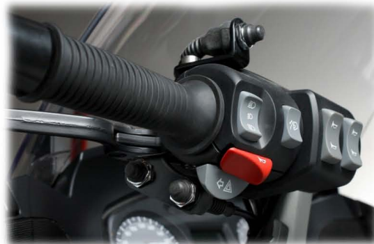
Momentary Push Button Siren Switch (Manual/Airhorn) Single Push to Talk Switch